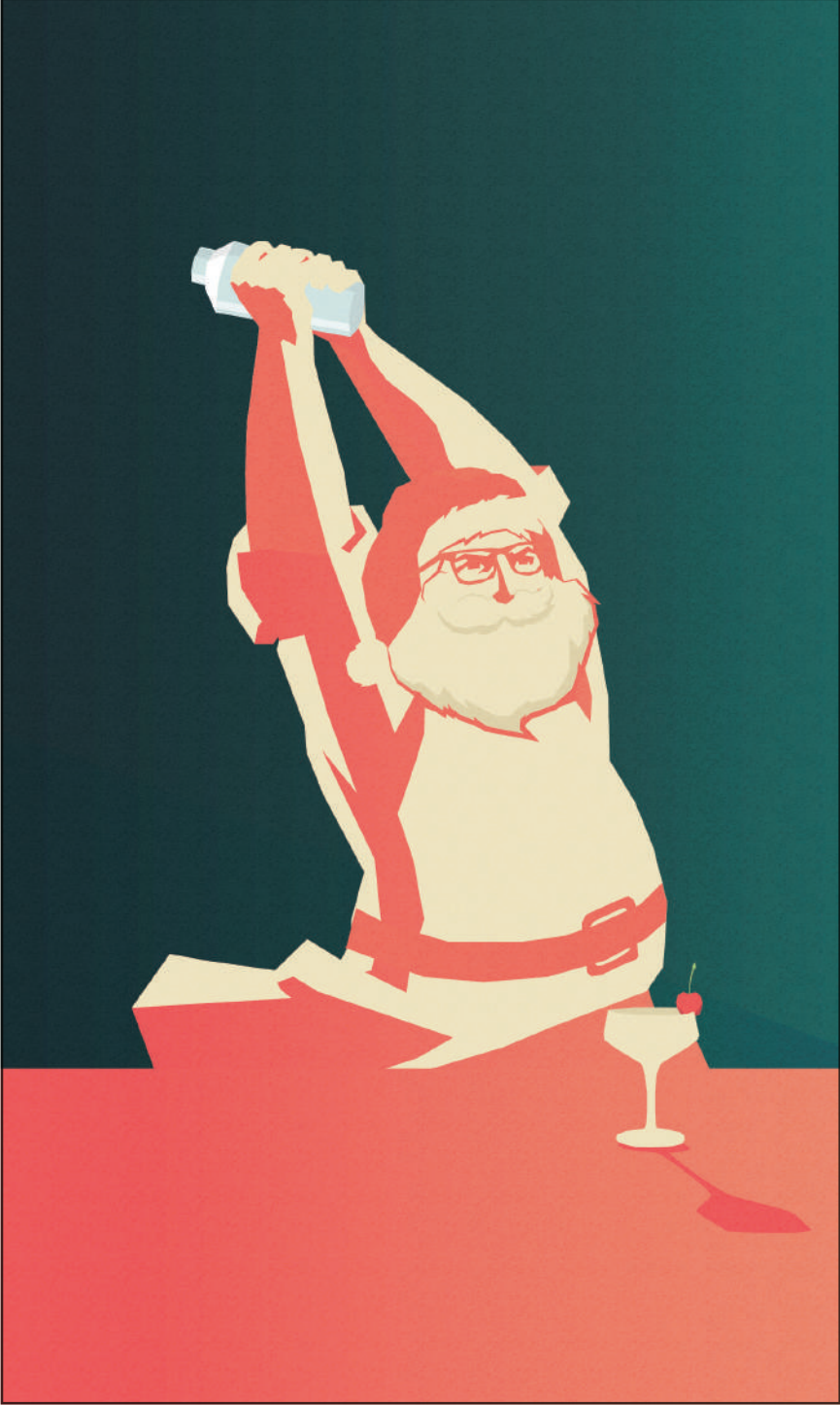
NIGHTMARE ON 1ST STREET